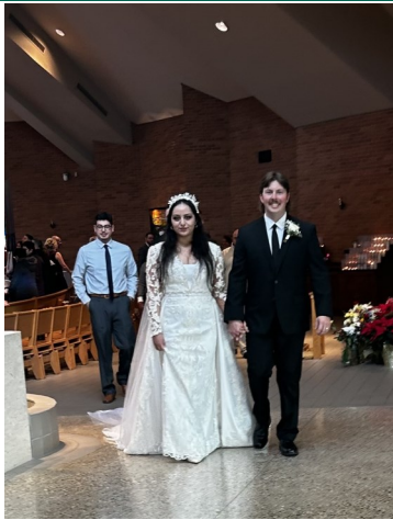
Left: Howe Wedding 12-14-24 Izquierda: Howe Wedding 12-14-24