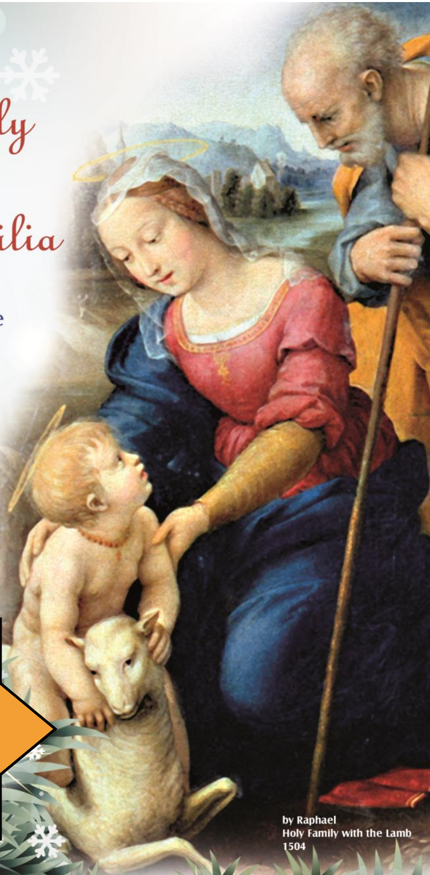
by Raphael Holy Family with the Lamb 1504

Solemnity of Mary Monday, Jan. 1, 2018 10:30 AM